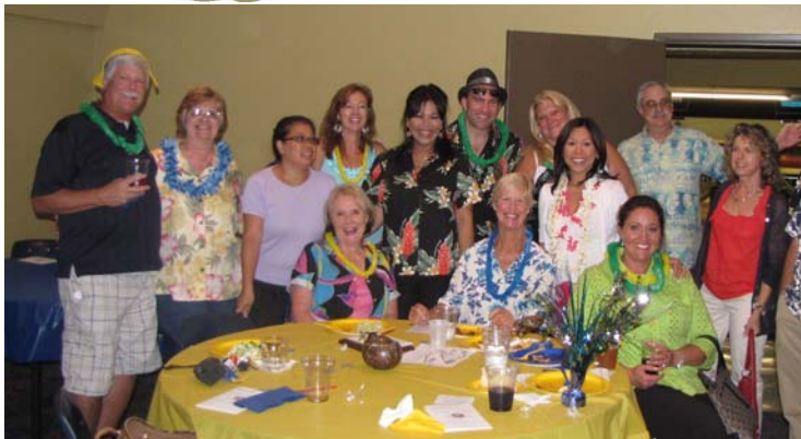
Many of the club members posed for a photo at the end of the event. Sorry we didn't get everyone.