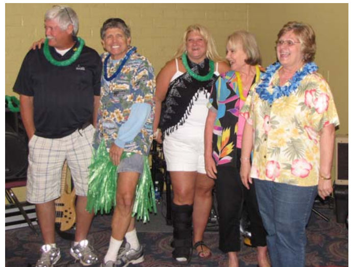
Executive board is retired after a year of great service and work