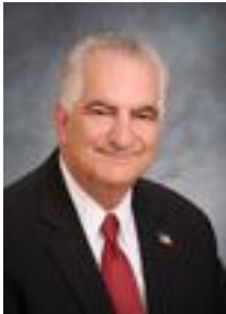
Mayor Frank Scotto