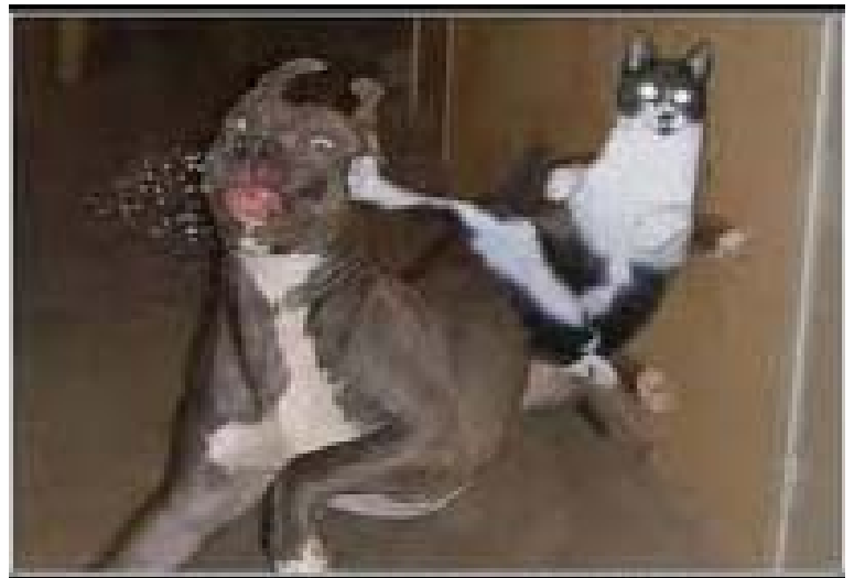
CHUCK NORRIS KITTY