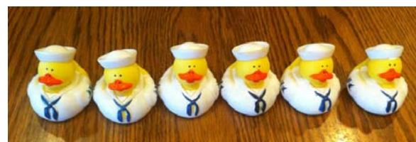
ALL DUCKS ON DECK

Please check announcements in the newsletter to keep informed about important upcoming events.