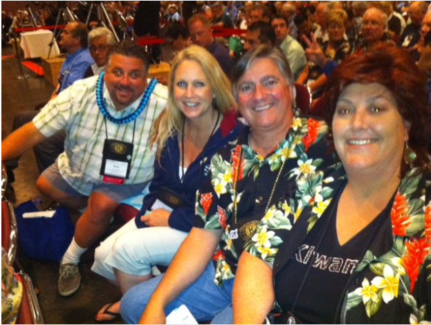
Lomita Kiwanis members on floor of House of Delegates