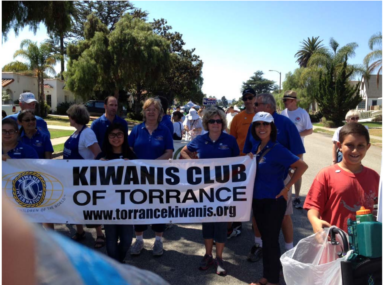
More than 30 Kiwanis members and family march in the Torrance Centennial Day Parade on Sunday September 16 th