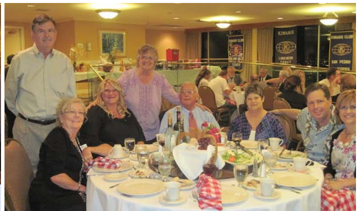
Kiwanis Club of Torrance