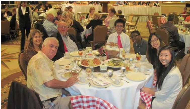
Kiwanis Clubs of El Segundo, Carson and Key Club from North High