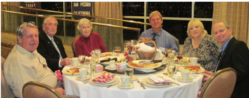
Kiwanis Clubs from Gardena Valley and San Pedro