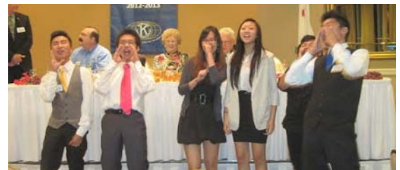
SLP Members giving a shout out