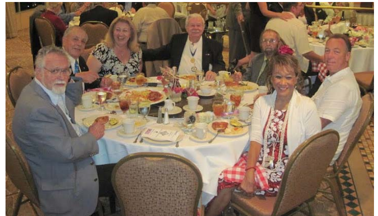
Kiwanis Clubs of Eastview and San Pedro