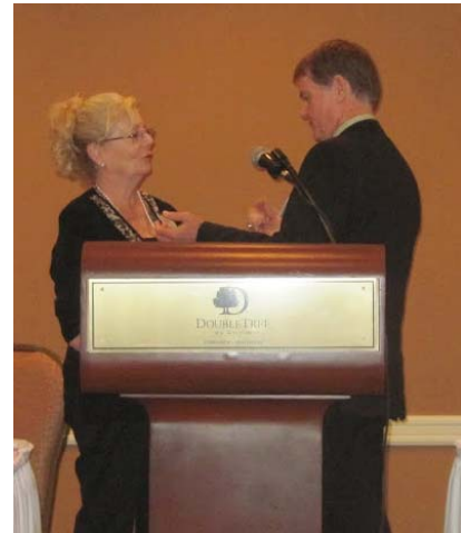
Governor Jander inducts Laurie Love as Lt. Governor Elect