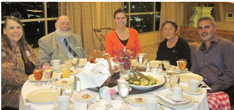
Kiwanis Clubs from Manhattan Beach, Lawndale & Torrance