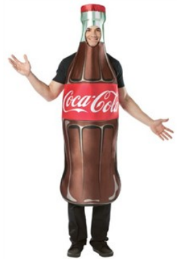
Coca Cola Costume