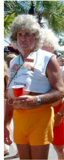
Retire Hooter Girl