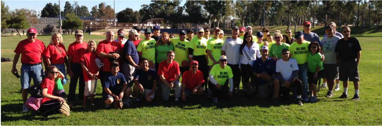
The 4 teams that participated in the softball challenge at the Torrance Centennial Birthday Bash.

Kiwanis was the big winner beating the Del Amo Rotary in the first game 12 -0 and the Lomita Torrance Airport Rotary 20 -2 in the second game.