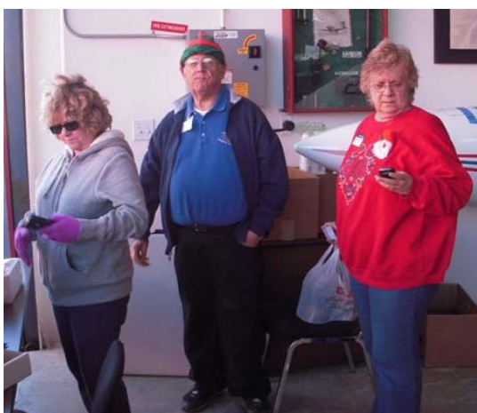
On December 15 th the Western Museum of Flight Santa Visit & Car Show. Several Torrance Kiwanis members volunteered at the event.