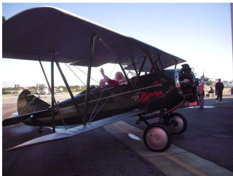
Santa going up for a test flight