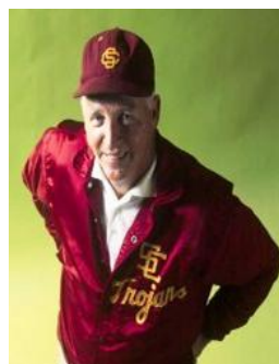
John McKay (USC)