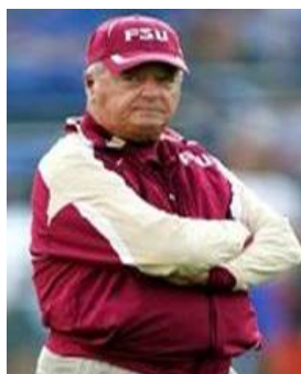
Bobby Bowden (Florida State)