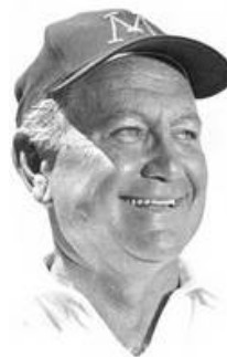
Murray Warmath (Minnesota)