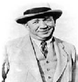
Knute Rockne/Notre Dame Bear Byant (Alabama)