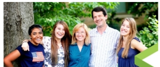
Host an International Exchange Student!

Hosting an exchange student is a wonderful way for the whole family to give back together while experiencing a new culture. Exchange students range from ages 15 to 18 and come from over 60 countries. They have studied English for at least 3 years and have their own spending money and health insurance.