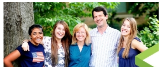
Host an International Exchange Student!