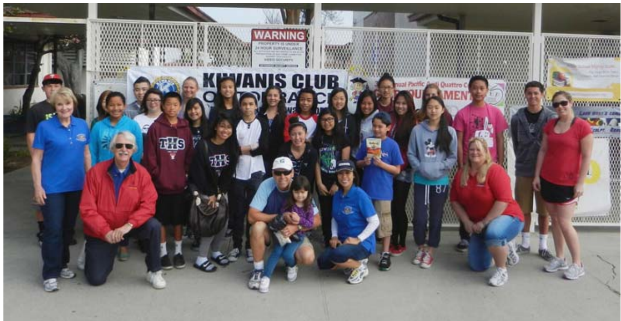
Torrance Kiwanis members, their families, Torrance & South High School KIWIN'S, Bishop Montgomery High School Key Club and parents at John Adams Elementary School in Torrance worked together in a campus clean up as our Kiwanis One Day Project