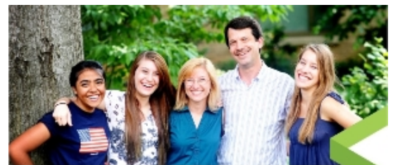
Host an International Exchange Student!