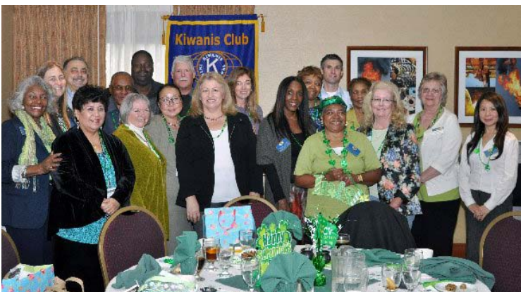
Torrance & Eastview Kiwanis Clubs inter-club with Carson on March 20 th

INTER-CLUB: Joining other clubs at their meetings is a great way to meet other Kiwanians and to share ideas on how to serve the community.