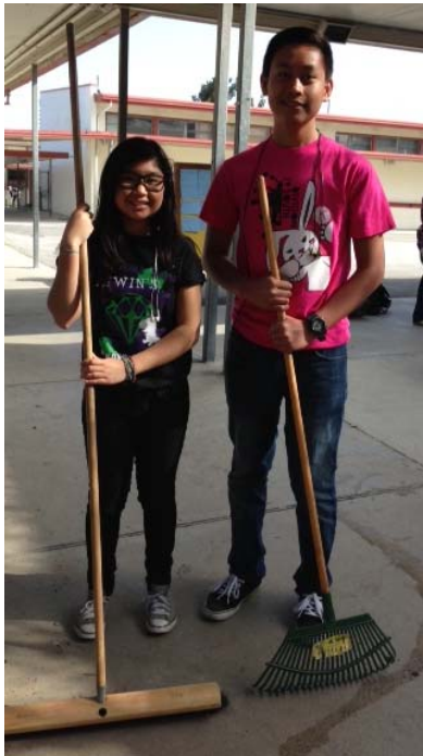
Young volunteers helping with clean up