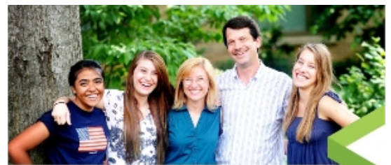
Host an International Exchange Student!