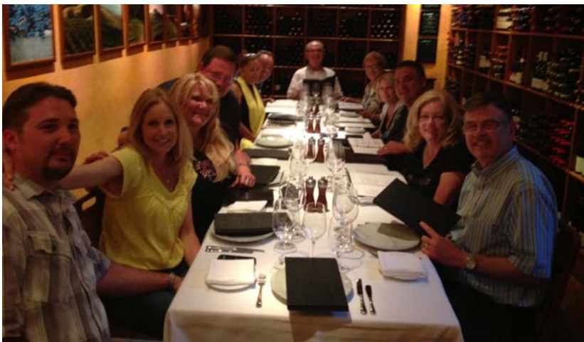
Torrance and Lomita-Harbor City Kiwanis members enjoyed a dinner together in Vancouver