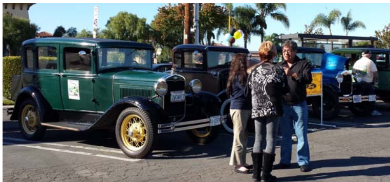
The Model A club brought several cars for display during the event