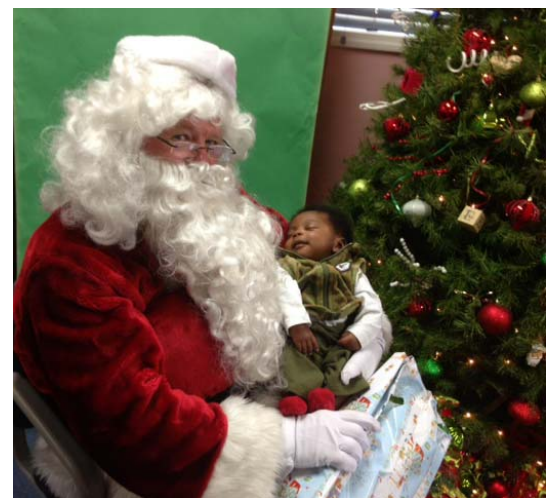
Santa with a new baby at the Stork Club.