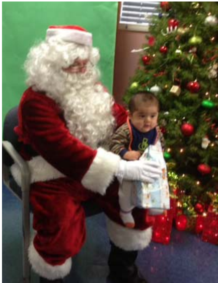
Santa at the Stork Club handing out wrapped toys to the children