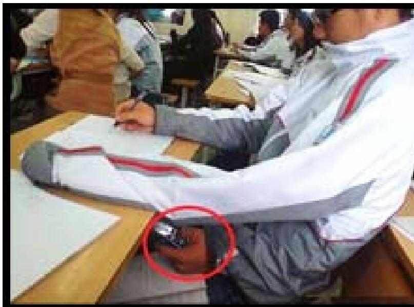
Nice way to text message in class.