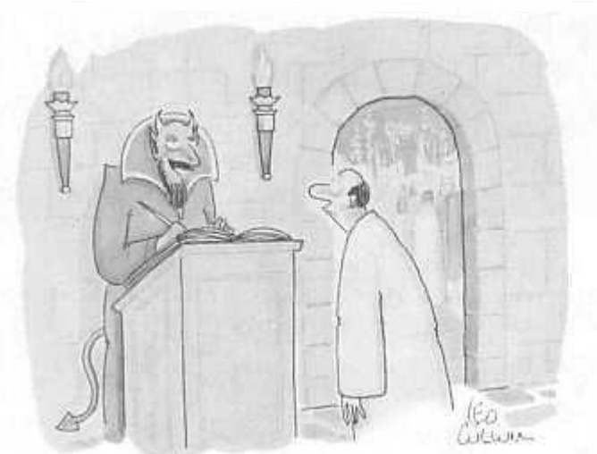
"And if you don't have an attorney, we've got millions of them."

' Thirdly , did your research also show you that my sister's husband died in a dreadful car accident, leaving her penniless with a mortgage and three children, one of whom is disabled and another that has learning disabilities requiring an array of private tutors?'