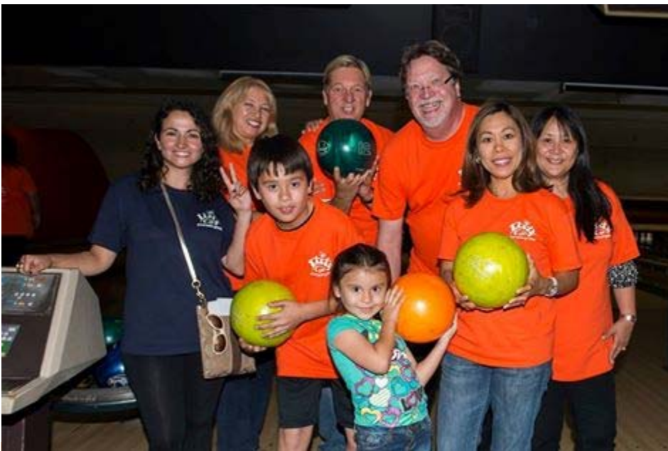
Torrance Kiwanis members and family bowl in Counseling4Kids Bowl4Kids event