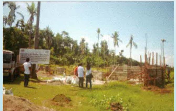
Building of the new village has started. With the funds donated by the Torrance Kiwanis Foundation. When it is completed it will be named K Torrance Village