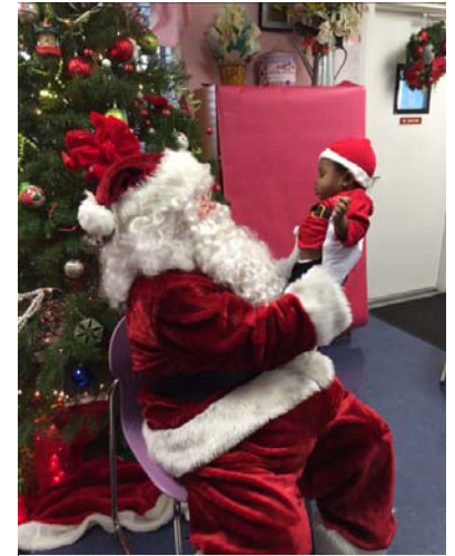
Santa with a 4 month old baby at the Stork Club on the Harbor UCLA General Hospital campus