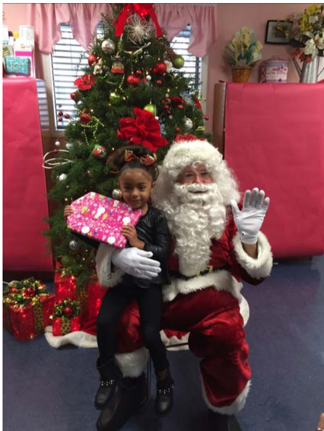
Santa at the Stork Club making children smile