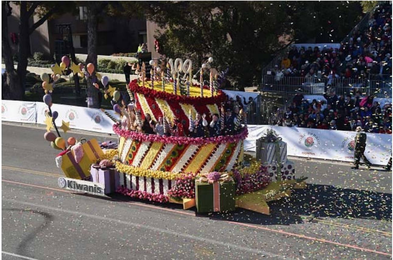
The Kiwanis International Float in the 126 Annual Tournament of Roses Parade