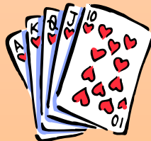
Table Sponsors and Silent Auction Items are requested

For those that do not want to play poker the brunch is only $30 Brunch.