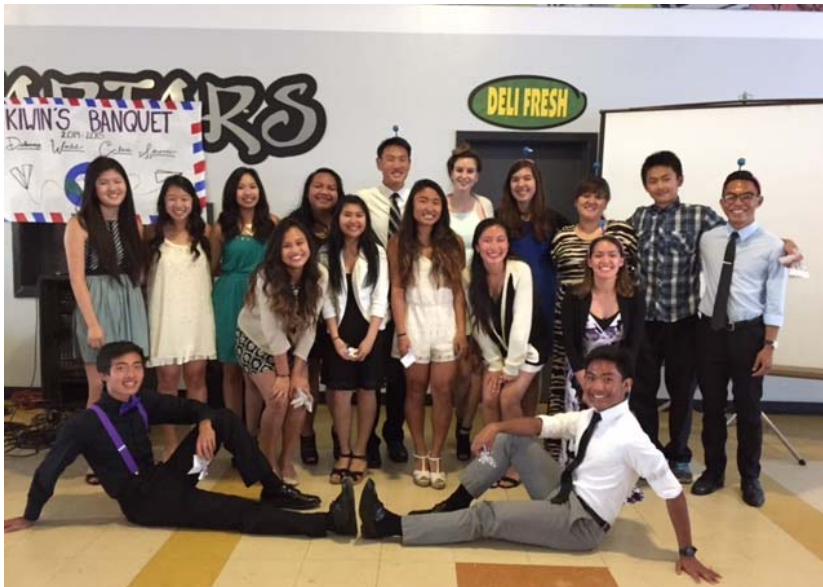
The 2014 -15 Torrance High School KIWIN'S