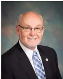
Mayor Pat Furey