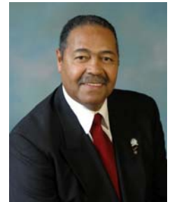
Governor Oscar Knight