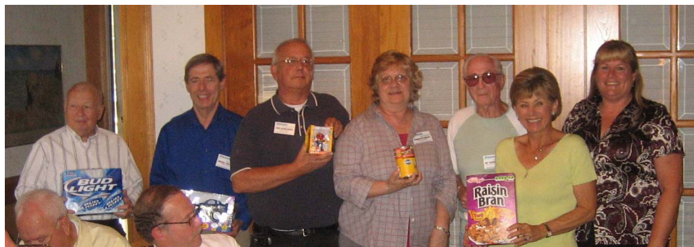
NASCAR RAFFLE WINNERS

NASCAR FACTS: Did you know that Viagra does sponsor a NASCAR. It hasn't won very many races. Experts say it's because it can "Get Up" to speed like it use to and the steering is a little "Stiff " in the turns.